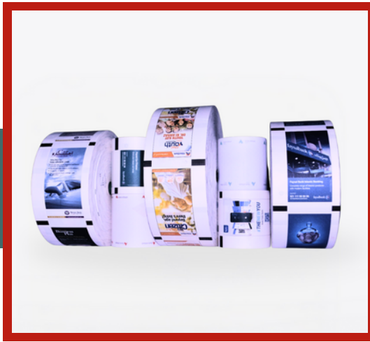
COMPLETE RANGE OF ATM THERMAL AND POS ROLLS